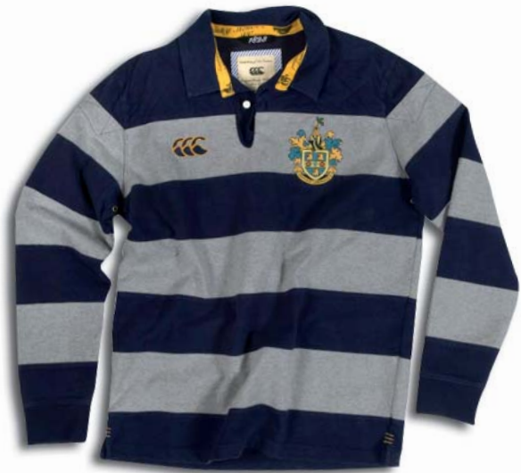
RUGBY - B992780 769