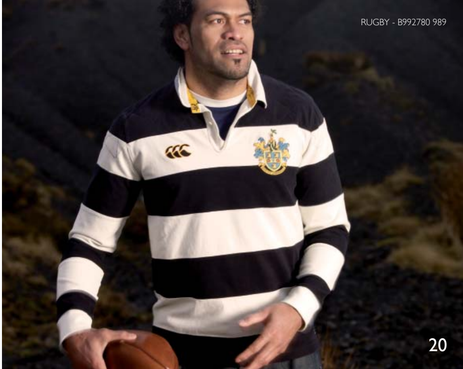
RUGBY - B992780 989