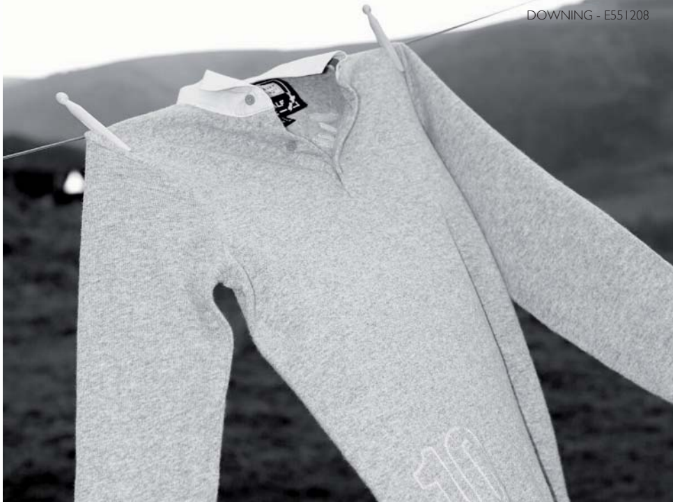
DOWNING - E551208